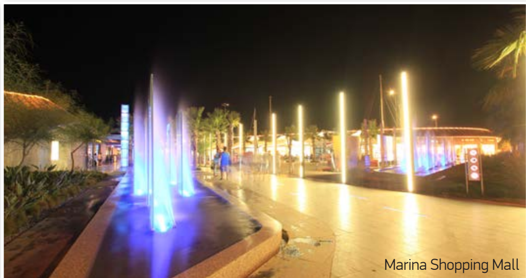
Marina Shopping Mall