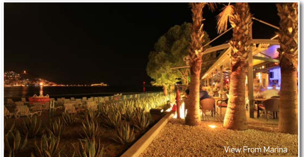
View From Marina